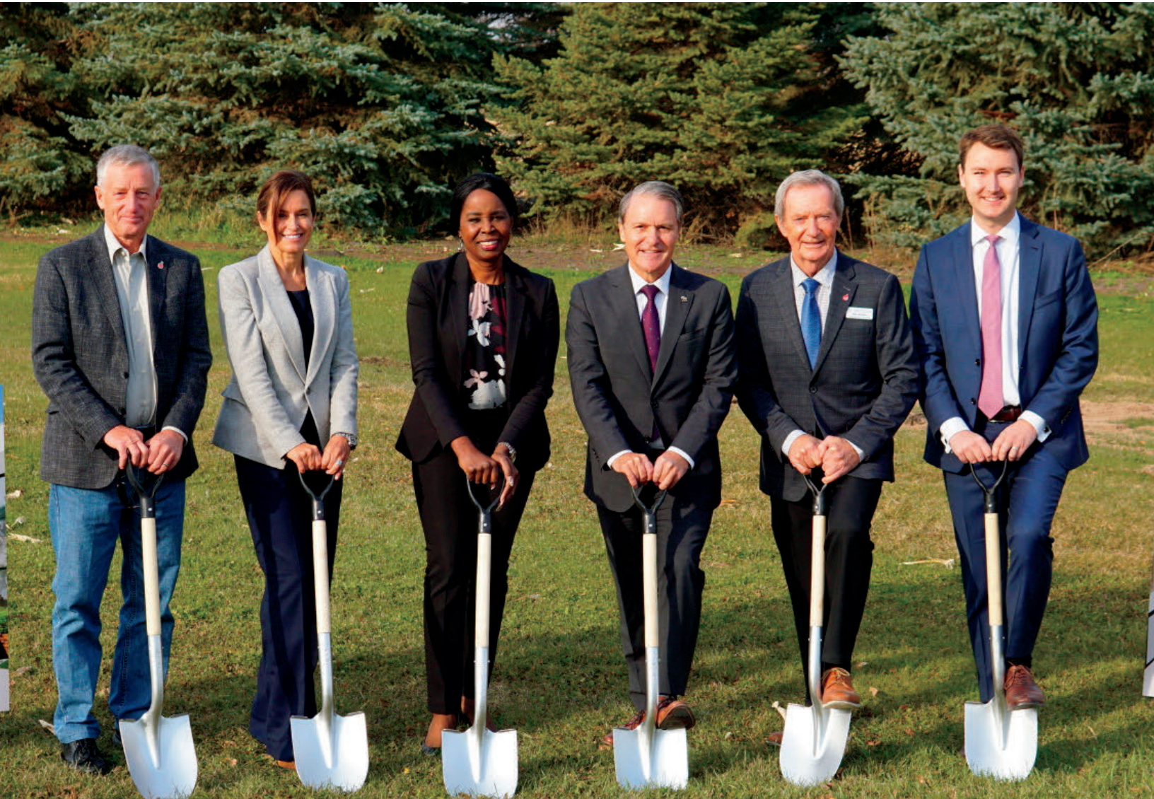
Ground Breaking Day for the BTHC Expansion